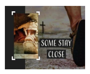
Some Stay Close