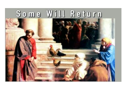
Some Will Return